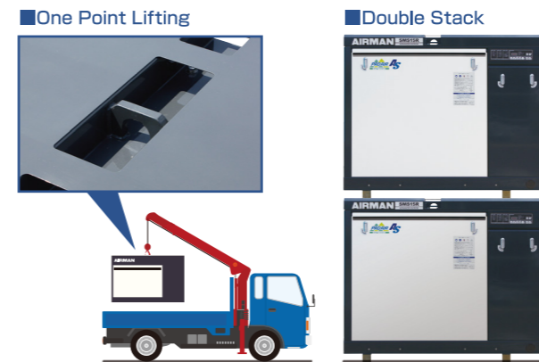
*Up to double-stack. *These are images.

One Point Lifting makes it easy to load onto vehicles. In addition, double stack can save space.