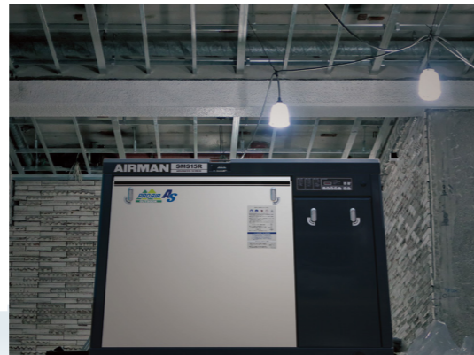
*These are images.

We offer a wide range of product lineup. : Nominal output 11kW<15PS> to 75 kW<100PS>